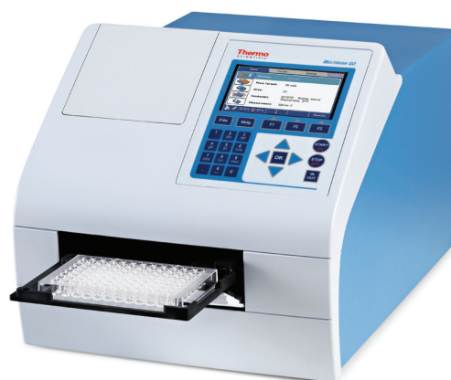
Thermo Scientific Multiskan GO without cuvette