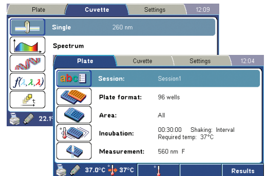
Easy to use internal software for quick plate or cuvette measurements