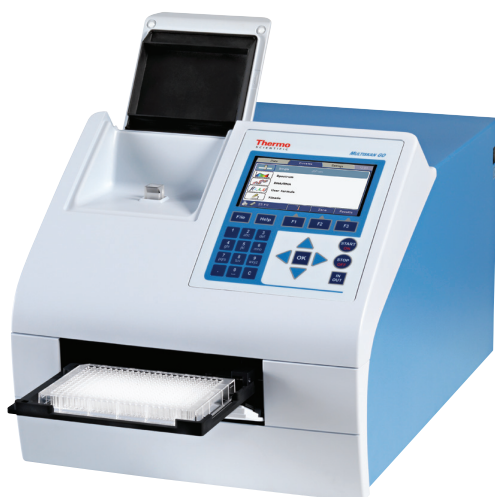
Thermo Scientific Multiskan GO with cuvette

The Multiskan GO can be controlled without a computer using the visual internal software and its large color display making it convenient for quick and simple measurements of both microplates and cuvettes. Ready-made sessions for measuring DNA and RNA concentrations and easy-to-use formulae for