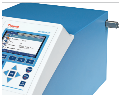
USB port for easy data transfer

The optical system in Multiskan GO has been engineered to ensure first-rate performance and high quality results. The design incorporates a dual beam optical system which includes an internal reference channel ensuring consistent results during any measurement condition.