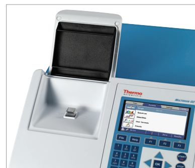
Multiskan GO accepts versatile cuvettes

* In SkanIt Software, the calculation is performed in compliance with the European Pharmacopoeia guidelines.