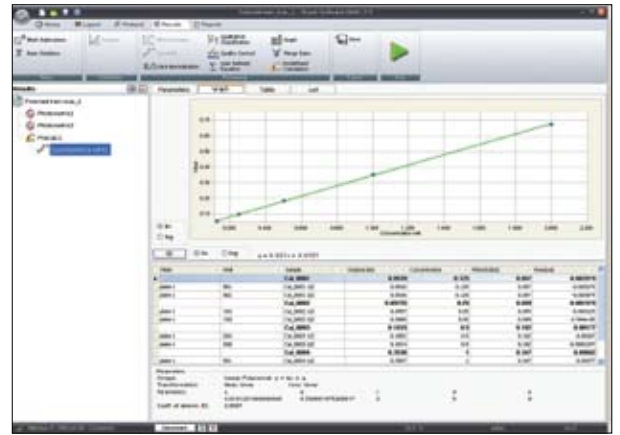
Visual and logical user interface of SkanIt Software

Built using the highest quality components, Multiskan FC conforms to the RoHS (Restriction of Hazardous Substances) directives.