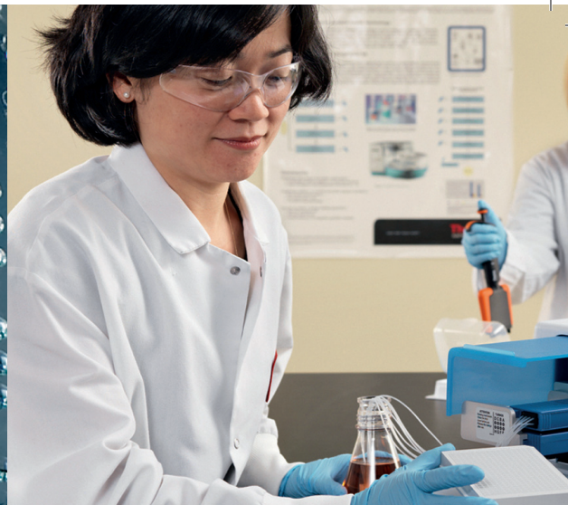
Thermo Scientific Multidrop Combi nL reagent dispenser