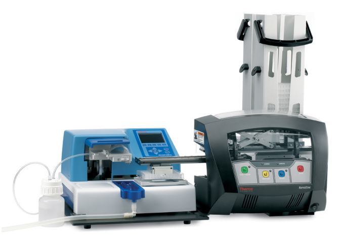
RapidStak with Multidrop Combi nL - solution for automated reagent dispensing