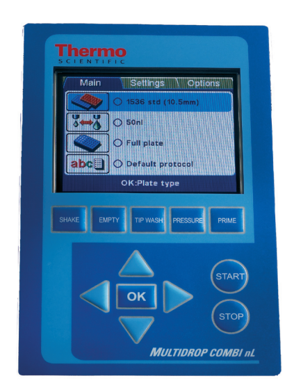
Multidrop Combi nL keyboard and display

Thermo Scientific Multidrop Combi nL, the latest arrival in Multidrop bulk reagent dispenser family brings unrivalled reliability to meet low volume reagent dispensing requirements in pharmaceutical and biotechnology laboratories. Multidrop Combi nL dispenses volumes from 50 nl to 50 µl into 1536, 384 and 96 well plates with excellent precision and accuracy.